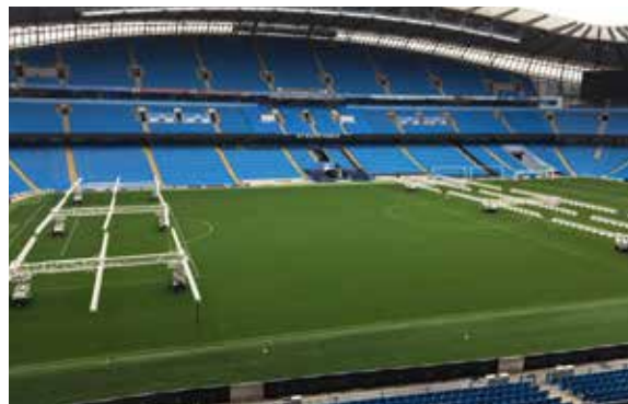
Vy från 93:20, East/West Stand

Casual. No shorts, (does not apply to children under 12). Guests are asked to adhere to the casual dress code that is applicable to their facility. Strictly no away colours or offensive t-shirts. The Club has the right to refuse admission to any person wearing attire deemed inappropriate in any of the lounges.